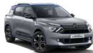
STEEL GREY BODY WITH COSMO BLUE ROOF