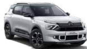
POLAR WHITE BODY WITH PLATINUM GREY ROOF