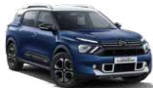
COSMO BLUE BODY WITH POLAR WHITE ROOF