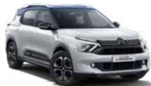
POLAR WHITE BODY WITH COSMO BLUE ROOF