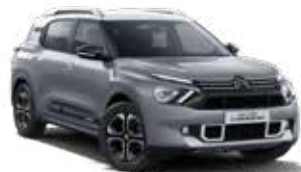
STEEL GREY BODY WITH POLAR WHITE ROOF