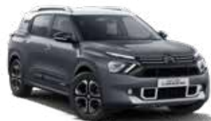
PLATINUM GREY BODY WITH POLAR WHITE ROOF