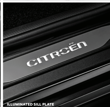
ILLUMINATED SILL PLATE