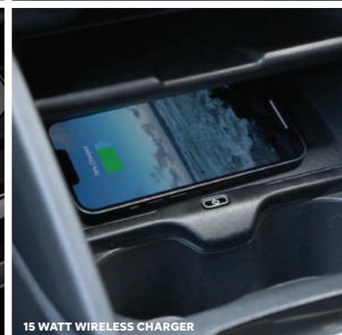
15 WATT WIRELESS CHARGER