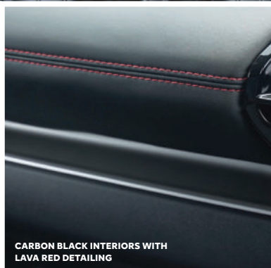
CARBON BLACK INTERIORS WITH LAVA RED DETAILING

*Actual color of vehicle and upholstery might differ. Accessories shown and features mentioned may not be a part of standard fitment & may vary basis model & variant.