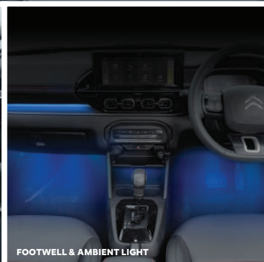
FOOTWELL & AMBIENT LIGHT