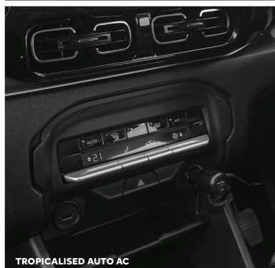
TROPICALISED AUTO AC