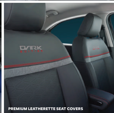
PREMIUM LEATHERETTE SEAT COVERS