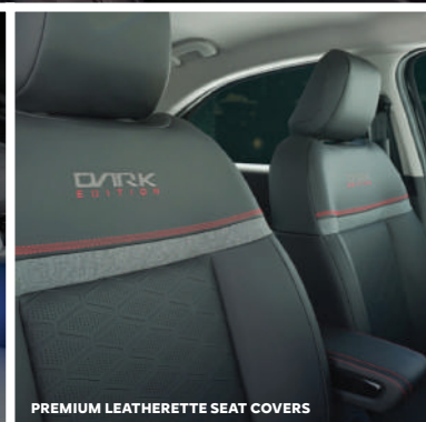
PREMIUM LEATHERETTE SEAT COVERS