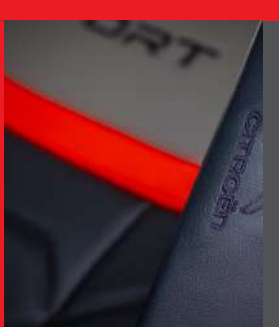
RACEFIT SEAT BELT