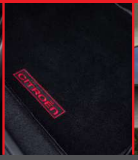
GRIP CARPET MAT