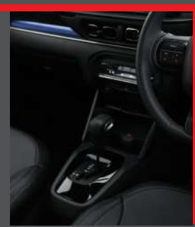
SIGNATURE AMBIENT LIGHT