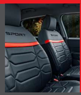
COMFORTPRO SEAT COVERS